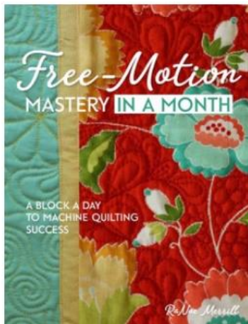
Free-Motion Mastery in a Month

Please state that you are from the Israeli Quilters Association taking her zoom workshop in July.